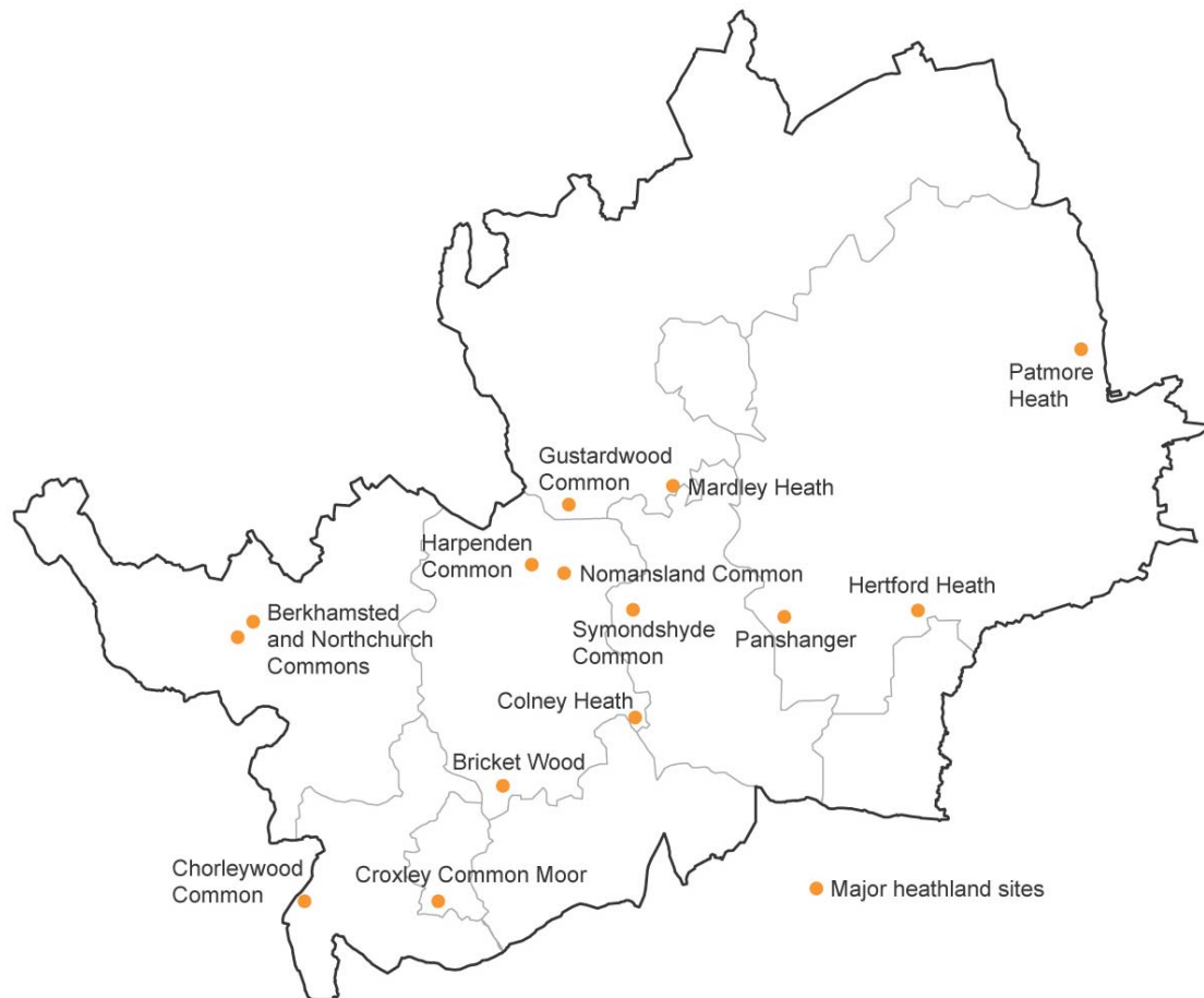
Map 6.1 – Existing heathland sites in Hertfordshire

Little work has been done on the status or extent of decline of species associated with heathland and acid grassland habitats. The production of the Hertfordshire Red Data Book by the Herts Natural History Society (Sawford, 1990) will help provide this information. This will include species still found in the county, but could also include species known to have become extinct locally.